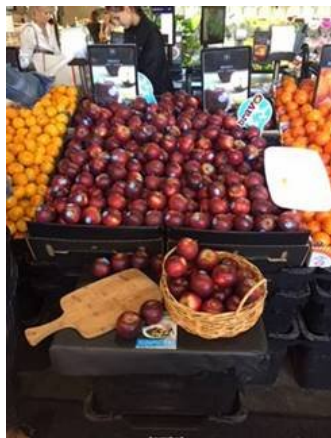
Pic: The Boatshed, WA