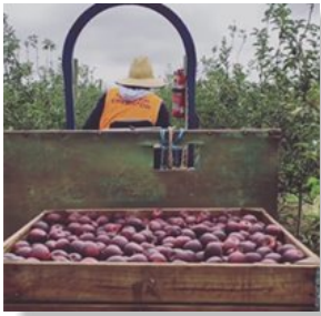
Pic: The last bin from Newton Orchards being collected, Manjimup WA

We have this week finished the 2018 Bravo™ Apple harvest, with 2260 bins of ANABP01 picked this season. The actual harvest is close to the crop estimates provided earlier in the season. In our first week we have packed 6% of the harvested fruit.