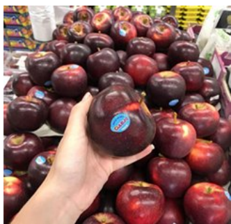
Pic: IGA Canning Bridge, WA

Please enjoy some of the photos from Bravo™ Apple retailers this week: